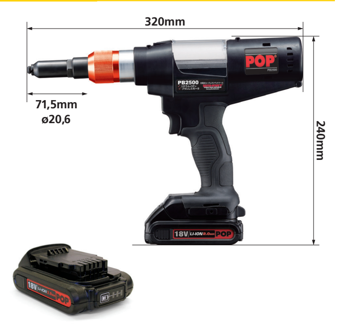
2.0Ah battery with charge indicator